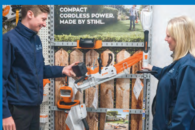
Expert advice on equipment to hire or buy