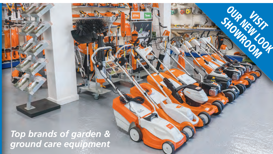
Top brands of garden & ground care equipment

Stirling Road, Drymen, Glasgow G63 0AA T: 01360 660 688 frascrobb.co.uk