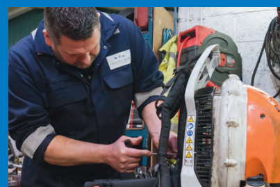
Servicing & repair from highly trained engineers