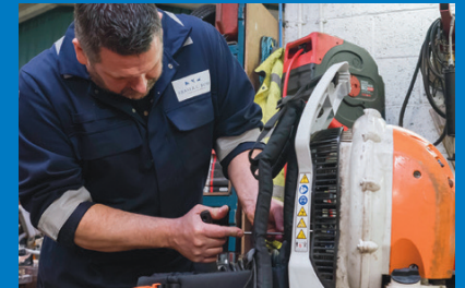
Servicing & repair from highly trained engineers