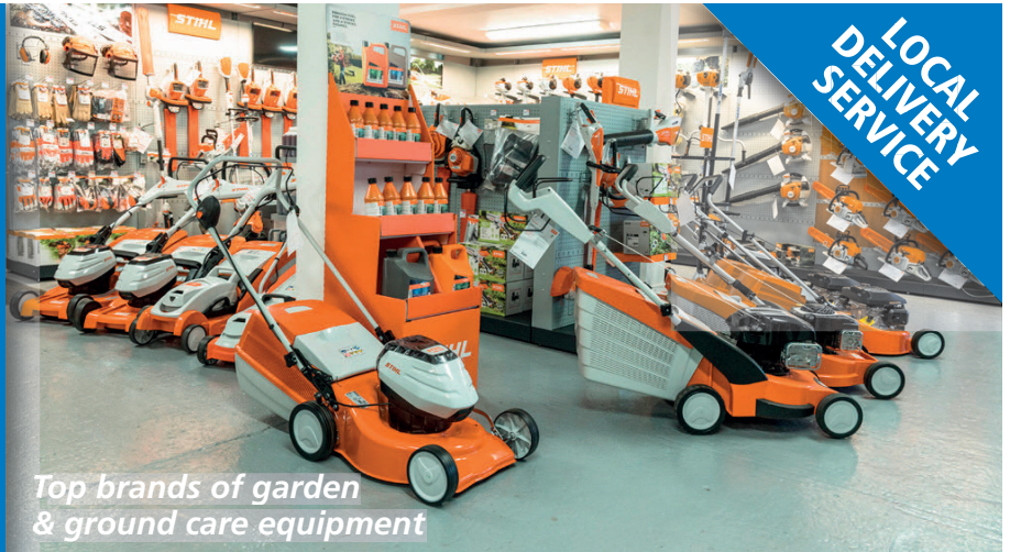
Top brands of garden & ground care equipment

Stirling Road, Drymen, Glasgow G63 0AA T: 01360 660 688 frasercobb.co.uk