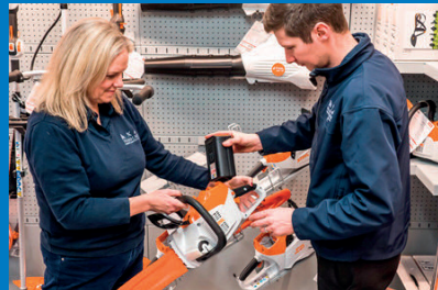
Expert advice on equipment to hire or buy