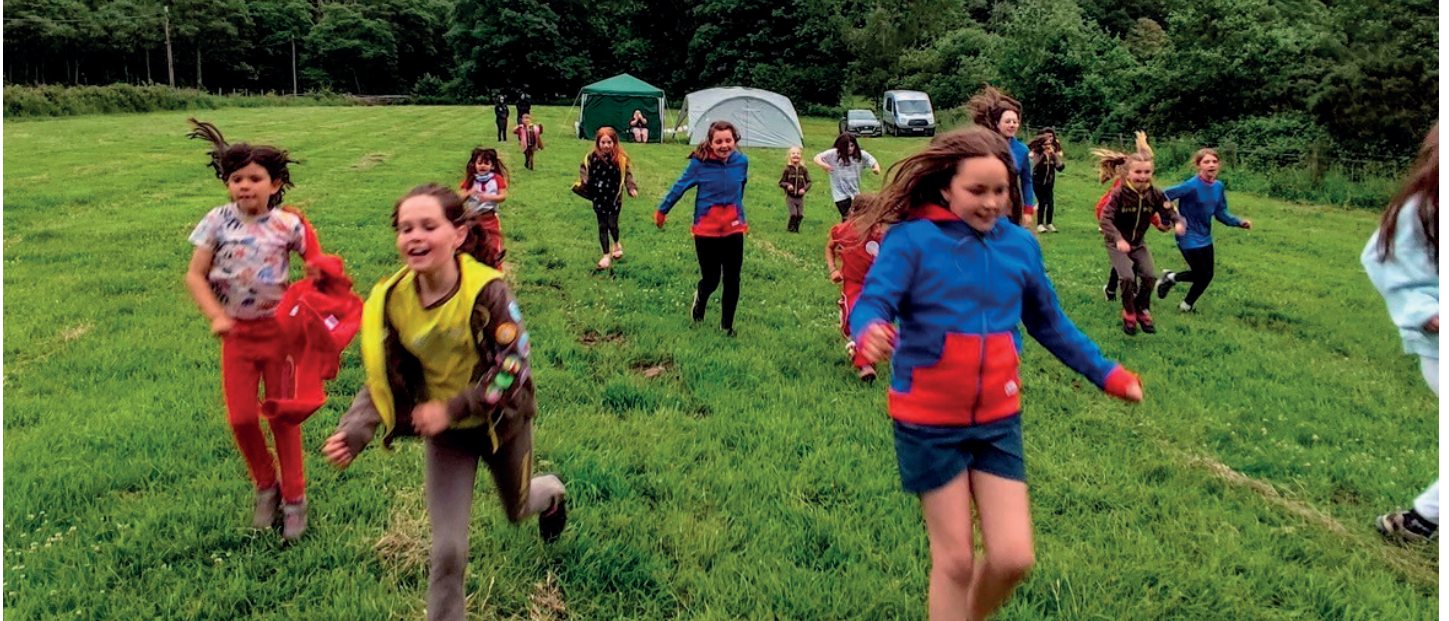
Midgefest 2022. See P8