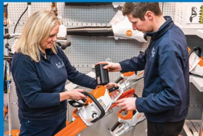
Expert advice on equipment to hire or buy

Stirling Road, Drymen, Glasgow G63 0AA T: 01360 660 688 frascrobb.co.uk