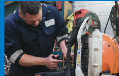
Servicing & repair from highly trained engineers