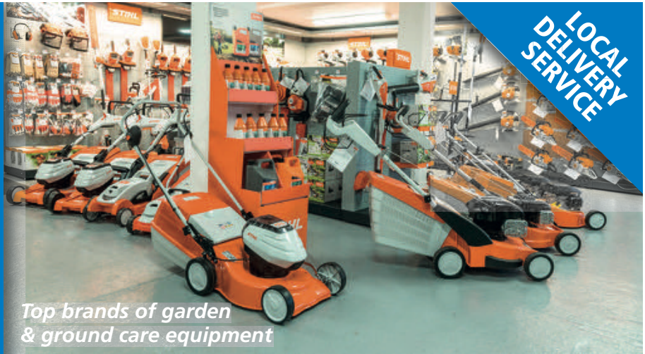
Top brands of garden & ground care equipment