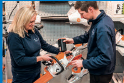
Expert advice on equipment to hire or buy