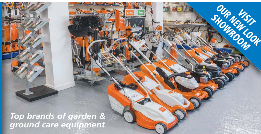
Top brands of garden & ground care equipment

Stirling Road, Drymen, Glasgow G63 0AA T: 01360 660 688 frasercrobb.co.uk