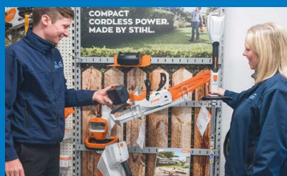
Expert advice on equipment to hire or buy