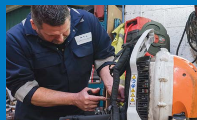
Servicing & repair from highly trained engineers